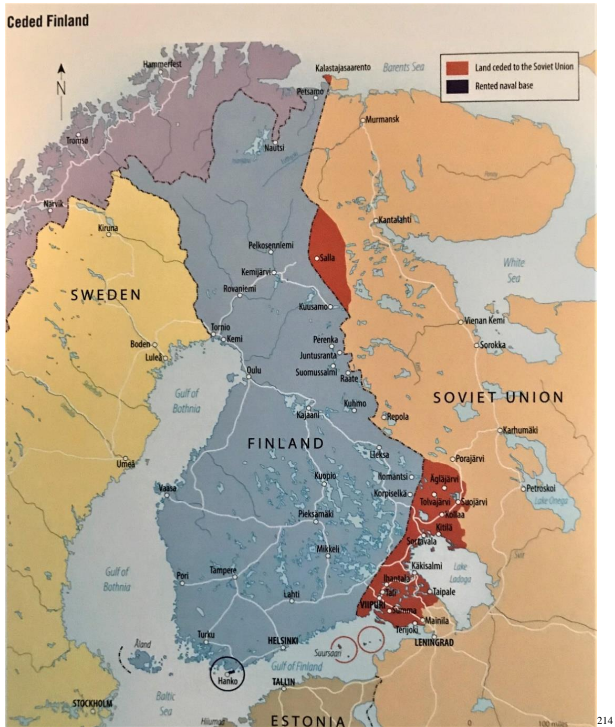
Map 1: The territory ceded by the USSR at the end of the Winter War. (The land between Lake Ladoga and the Gulf of Finland is the Karel'ian Isthmus.)